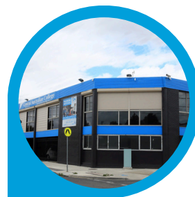
FOOTSCRAY CAMPUS (Main Campus) 8 Cross street, Footscray West, VIC 3012