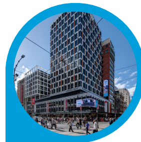
MELBOURNE CBD CAMPUS Level 1, 276 Flinders Street, Melbourne 3000