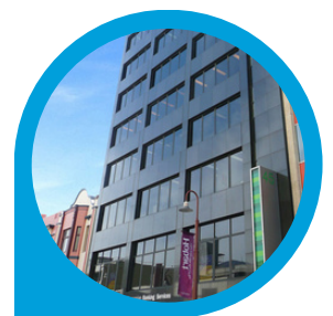
HOBART CBD CAMPUS Level 3&4, 45 Murray Street, Hobart, TAS 7000